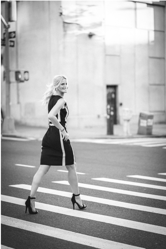
James Diaz Photography

CREATING emotive VISUAL ART WITH AUTHENTIC AND PASSIONATE CLIENTS IN A storytelling STYLE OF HUMAN connection AND LOVE